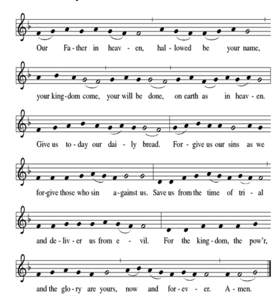
SENDING God blesses us and sends us in mission to the world.