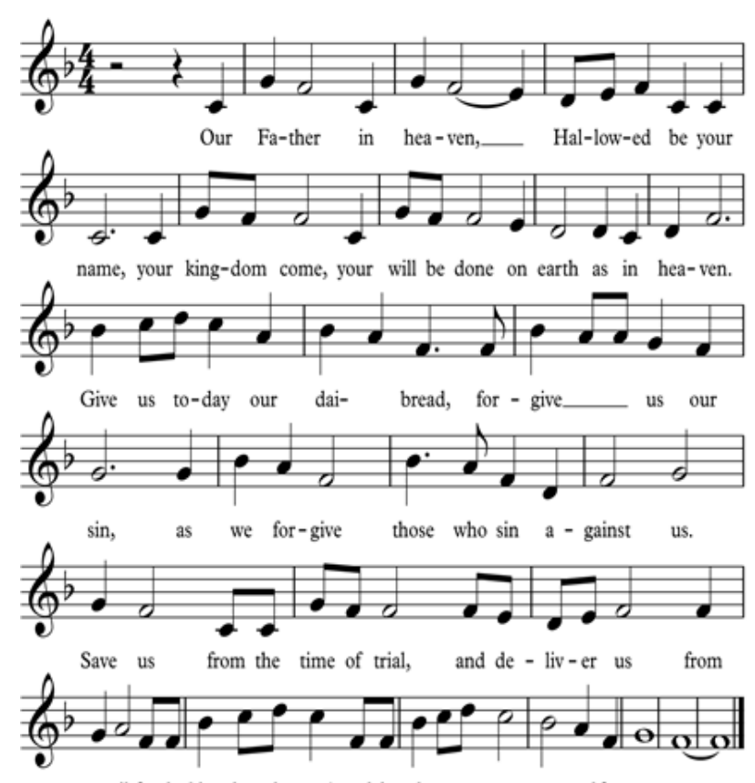
e vil, for the king dom, the pow'r, and the glo ry are yours, now and for ev - er.

Music Copyright 1986 G. I. A Publications Reprinted under OneLicense.net A713717