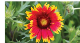
Blanketflower Arizona Sun (5) - $215