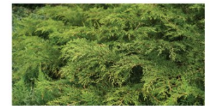
175cm Cedar Black (7) - $1,765 125cm Cedar Black (7) - 1,590