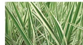
Sedge Evercolor Everest (5) - $215