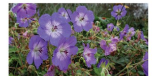
Cranesbill Azure Rush (22) - $1,385